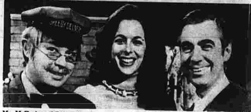
Mr. McFeely and Betty Aberlin, regulars in the cast of 'Mr. Rogers' Neighborhood,' join host Fred Rogers on many of the Neighborhood visits in the cast of 'Mr. Rogers' weekdays at 5 p.m. on public television.